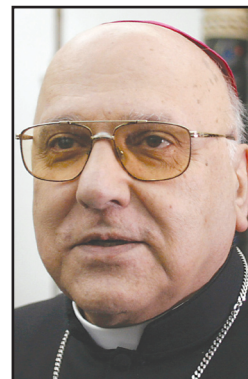
Patriarch Michel Sabbah